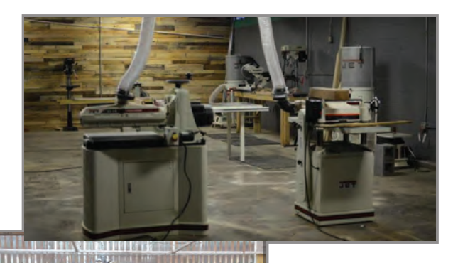
Fort Houston has a shop area outfitted with a wide assortment of new Jet tools

will be on Saturday, June 8th, 2013 from 2 p.m. until 5 p.m. at Fort Houston in Nashville, Tennessee, and will feature an informal presentation on "Promoting Your Business with Social Media", as well as a Shop Crawl to the shops of some of our other members who are located in that neighborhood.