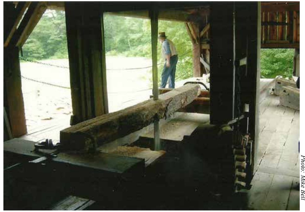
Operating water-powered up-and-down sawmill at Old Sturbridge Village where Bell made handmade reproductions of period furniture. The sawmill is a reproduction of the 19th century Nichols-Colby Sawmill of Bow, New Hampshire.

But I am grateful that we still have sanctuaries like the virgin forest of Tennessee where we can take refuge from our hectic digital-click, drive-through world. And when I think about the tree giants in the Albright Grove it hits me: two centuries ago these pioneers dreamed our civilization, and today, we dream their wilderness. -Mike ♦