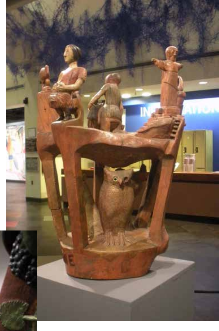
The Folk Art Sculpture of Anselmo Harris at the TSM: Above: "Here Is Where We Play", At Left: "Our Home" both works are circa 1890

retirement in Union City. His carvings were inspired from religious topics, as well as from subjects from nature, some representing the region around Reelfoot Lake. The pieces shown here were rendered on a large scale from a single log, with the component figures roughed out with a mallet and chisel. "Here Is Where We Play," made about 1890, displays a variety of animals of the forest smelling flowers and coexisting with a boy and a girl at play. The other sculpture from the 1890s, "Our Home," is made from cypress wood and includes Christ on the cross and a woman at a well, perhaps referring to Rebecca in the Book of Genesis.